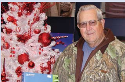
Marvin Deno – Wireless Router